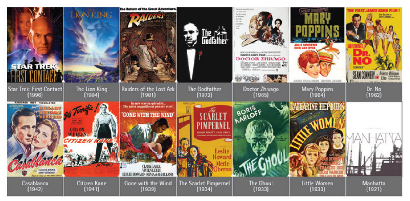
Several of Hollywood's most renowned films have been restored using Lowry Digital technology

Disney: Short films and feature films like 'Dumbo', 'Snow White', 'Cinderella', 'Sleeping Beauty' and several others were scanned at 4K, color corrected and restored according to fixed specifications. Dirt and dust were removed from each of these films, and scratches and grains were cleaned up.